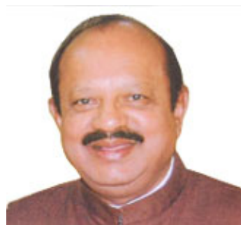
Honorable Minister Shri. T.B. Jayachandra

Meeting with the Minister of Law, Justice and Human Rights, Parliamentary Affairs and Legislation, Animal Husbandry, Government of Karnataka, Bangalore