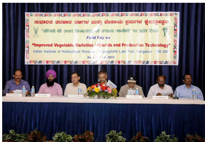
Dignitaries on the dais during the field day seminar