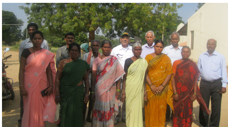
A group photo of all beneficiaries and visiting PNASF team at M/S Namadhari Agro Fresh Private Ltd, I.D. Halli