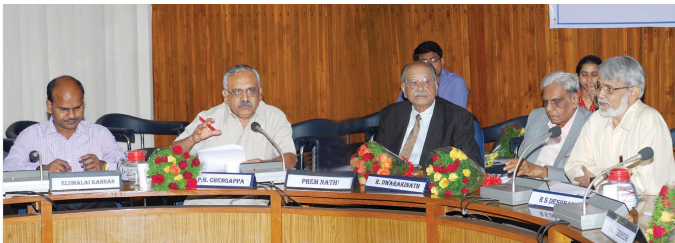
Dignitaries during the seminar on Development Trends in Urban and Peri-Urban Agriculture (UPA)