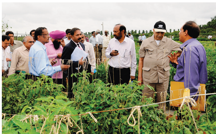
Tomato Demonstration Plot at IIHR