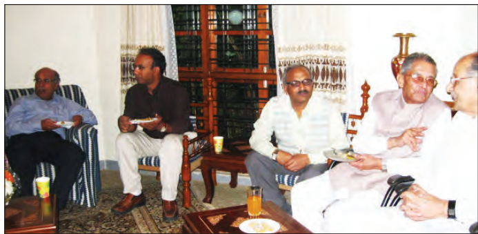
PNASF family during the New Year Get Together Party

India. The occasion expressed togetherness on relevant issues facing farmers and consumers. The newly published PNASF News letter was distributed on this occasion.