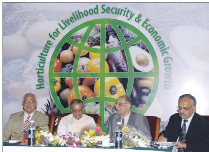
Dignitaries on the dais during Valedictory Session.

2009 at the conference venue. Shri M.V. Rajasekharan, former Union Minister of State for Planning, Government of India was the Chief Guest. Addressing the gathering Shri Rajasekharan expressed his deep concern over the growing population, food insecurity, malnutrition, health problems, unemployment, hunger and poverty, climate change and vagaries of climate.