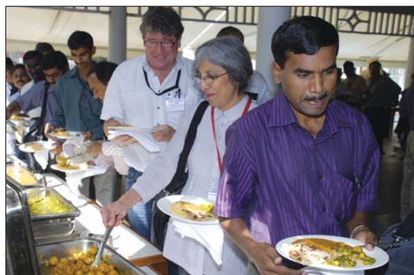
Delegate at the dinner