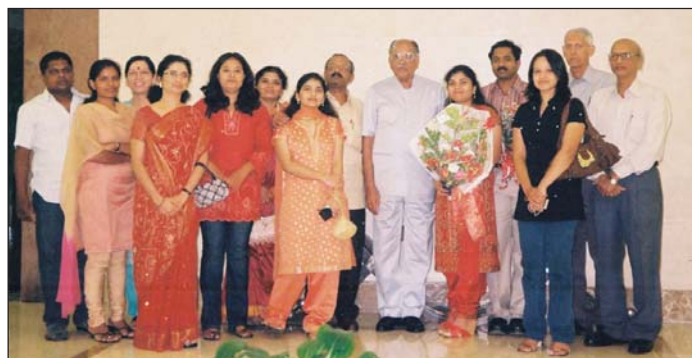
Guests at the party