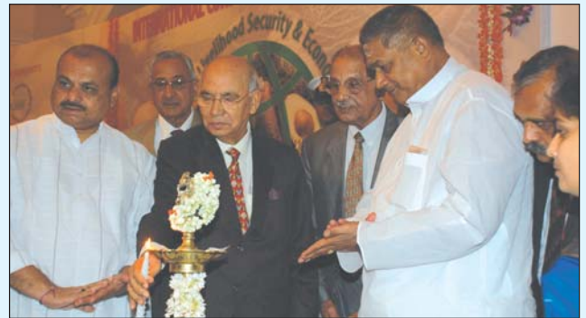
Shri H.R. Bhardwaj inaugurating by lighting the lamp

His Excellency, the Governor of Karnataka, Shri Hans Raj Bharadraj, inaugurated the International Conference on Horticulture (ICH-2009) "Horticulture for Livelihood Security and Economic Growth" on November 9, 2009 at the ITC Hotel-The Windsor, Bangalore, India. About 750 delegates from 40 countries including Asia, Africa, Europe, Middle East and United States participated in the deliberations.