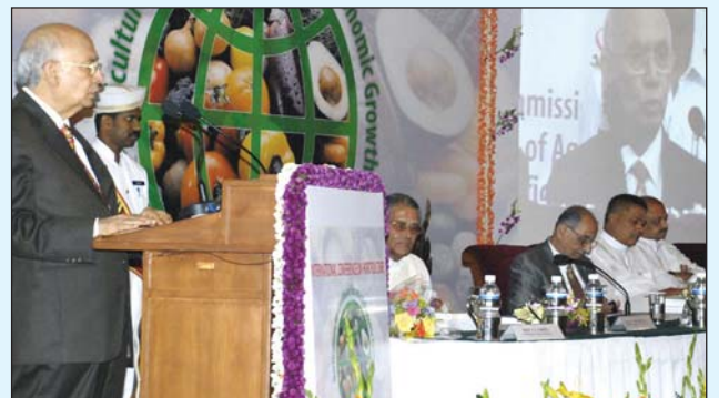
Shri H.R. Bhardwaj addressing the gathering

Addressing the gathering Shri Bharadwaj said that horticulture sector plays a prominent role in addressing the food security by providing food and nutrition and also generates ample employment opportunities that ensures livelihood for about 70% of the world population (majority of this population housed in India and China alone) involved in agriculture and allied activities.