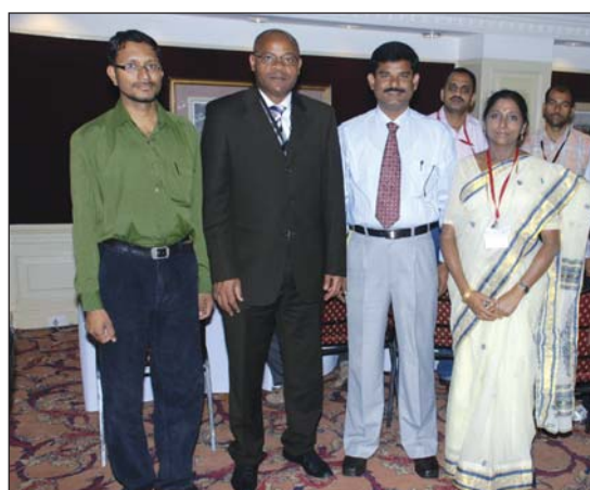
Hortivar Coordinator and Trainers

gave orientation to selected trainers and the trainers in turn trained the registered trainees. About 100 scientists, professors, students and progressive farmers were trained.