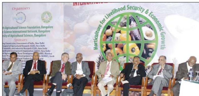
Panelists on the dais during the National Seminar of the Conference.