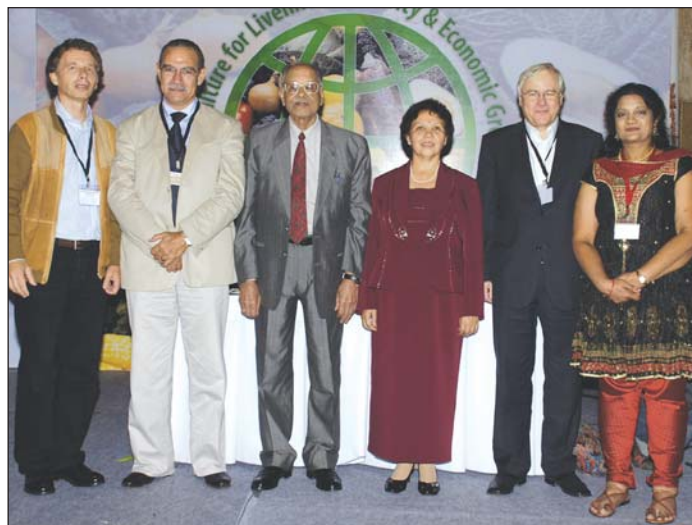
VEGINET Executive Members