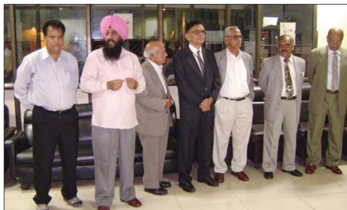
Guests at the get-together party