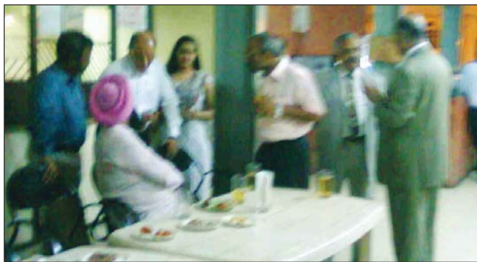
Guests during the dinner

harmonious efforts in making the event memorable one. The get-together consisted of the dinner at the Turf Club, Race Course Road, Bangalore participated by about eighty members on December, 2 nd 2009.