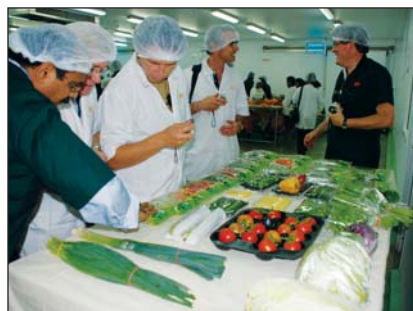
Study Tour and Excursion