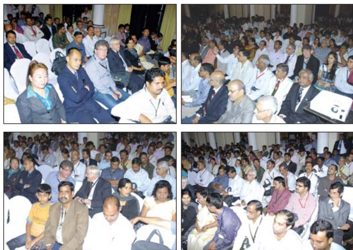
Audience during the Inaugural Session