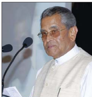
Shri M.V. Rajasekharan gracing the conference

horticultural crop practices coupled with micro irrigation technologies have proved beneficial in realizing more crop yield per crop and drop he added. The Minister was optimistic about the outcome of the conference and hoped that a draft document and action plan for providing livelihood security to the farmers will be developed by the conference in this conference hall in order to guide various stake holders of horticulture to initiate a horticulture based revolution in Karnataka state which will serve as a model for other states to follow. The conference was graced by Shri M.V. Rajasekharan, former Union Minister of State for Planning