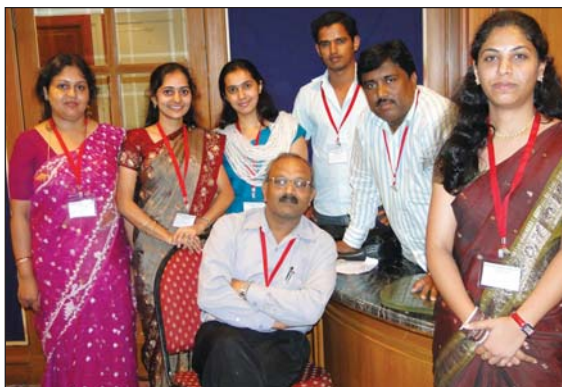
ICH News team

During the ICH-2009 three ICH News Letters on November 9, 10 and 11, 2009 were published and made available free to the participants. The ICH News highlighted the daily events and views of the conference.