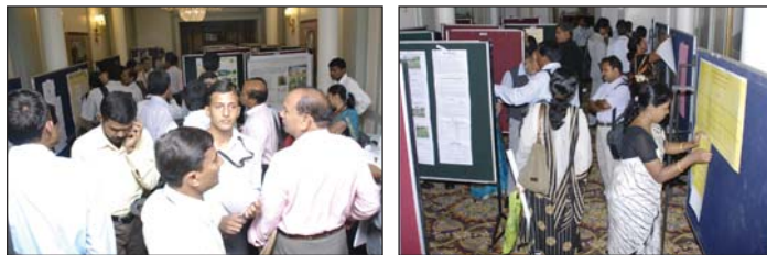
Participants in the Poster session of ICH-2009

About 750 delegates from 40 countries including Asia and the Pacific, Africa, Central Asia, Europe, Middle East and United States participated in the deliberations of the conference. There were 17 technical sessions including a seminar, covering six theme areas viz; Theme Area I: Technological Domain, Theme Area II: Institutional and Policy Support: Socio - Economic Domains, Theme Area III: Producer – Consumer Domain, Theme Area IV: Technical Cooperation among Developing Countries (TCDC), Theme Area V: Challenges and Opportunities in Horticulture - Seminar; Theme Area VI: Plenary Session: Opportunities and Future Thrusts. A total of 650 papers including 35 lead papers, 250 oral presentations, and 365 poster presentations were made. The Dr. B.P. Pal Memorial Lecture entitled