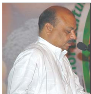
Honorable Shri Basavaraj S. Bommai addressing the audience

Shri. Basavaraj. S. Bommai, Honorable Minister for Major and Medium Irrigations, Government of Karnataka who also graced the occasion as the Guest of Honor, addressing the gathering