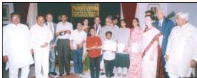
The team of FAO-PNASF Telefood Project with the Chief Guest & Guests of Honor on the occasion