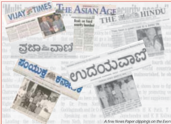
A few News Paper clippings on the Event