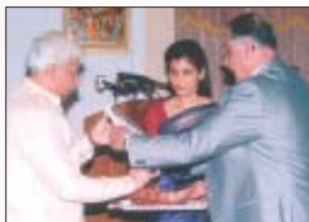
Sri H.K. Patil Hon'ble Minister releasing PNASF News presented by Ms. Shyamla Nath

On this occasion the Inaugural issue of the official News-letter of PNASF; a half yearly publication 'PNASF NEWS' was released by Shri. H.K. Patil, Honorable Minister for Agriculture, Government of Karnataka, who highlighted the importance of this publication.