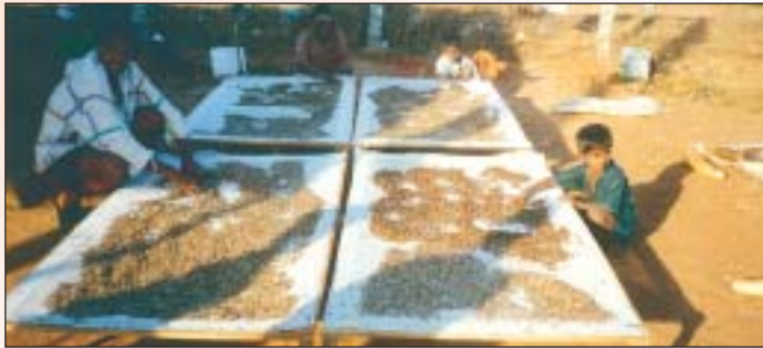
A view of drying of bottle gourd hybrid seeds produced by the mentally challenged children alongwith the Master Trainer of the project

The end result of the project activities was the establishment of three dimensional growth model leading to the sustainable income