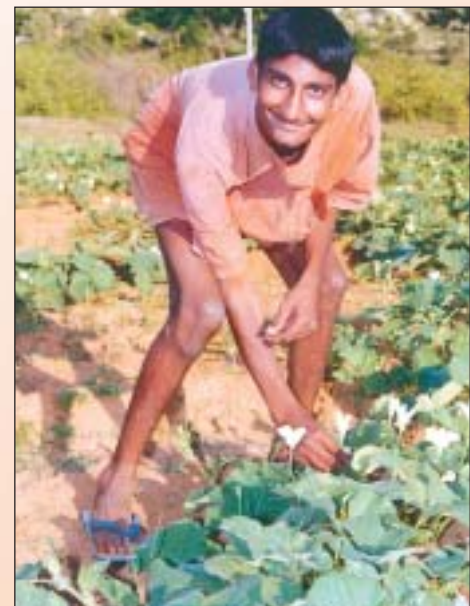
A metally challenged child crossing the bottle gourd flowers for hybrid seed production

generation through hi-tech horticulture, human well being through social symbiosis involving volunteers from Institute of Universal Consciousness(IUC), Bangalore, and neighboring villages offering self-less service, love and tender care to the children and a healthy and cheerful environment through linkage with the natural surroundings.